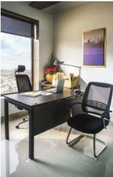
Area 120 Sqm Location 5th settlement, New Cairo Scope: Design, execution, furnishing.